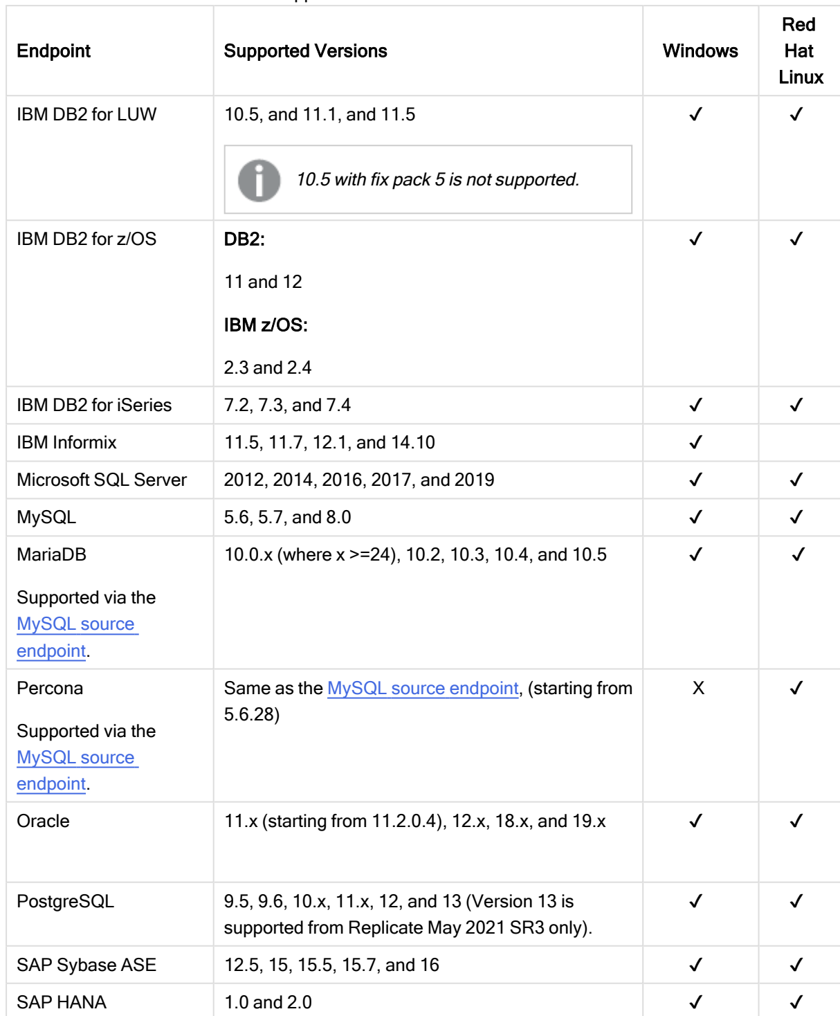
Supported relational database sources